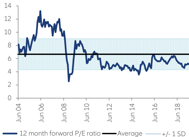
Figure 1: MSCI RUSSIA – 12 month forward P/E ratio

Past performance is not a reliable indicator of future results. Index performance does not reflect fees, brokerage commissions or other expenses of investing. It is not possible to invest directly in an index.